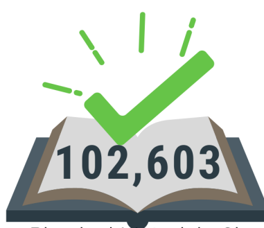
Physical Materials Circulated