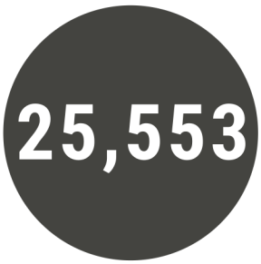
Digital Materials Circulated